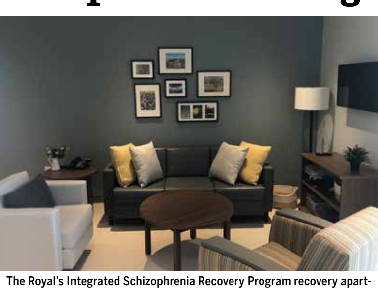
ment is an ideal environment for staff to assess clients' skills for independent living and to give support where needed.

A typical day in the apartment is like any other on the in-patient unit but there is an added responsibility of taking care of one's own needs. Clients staying in the apartment keep it clean and tidy, budget and shop for groceries, plan and prepare their own meals and do their own laundry. Clients are further engaged in their treatment by accessing their medication from the nursing station, and have constant support from nursing staff should the need arise. While living in the apartment,