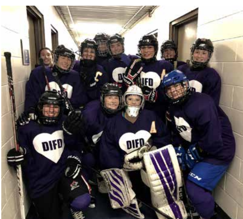
To date, DIFD has seen over 400 community-led events across North America! Visit difd.com/howtohelp to learn how you can get involved.

Follow us on Facebook, Twitter, and Instagram! Search for us at @DIFDroyal and use the hashtag #DIFD.