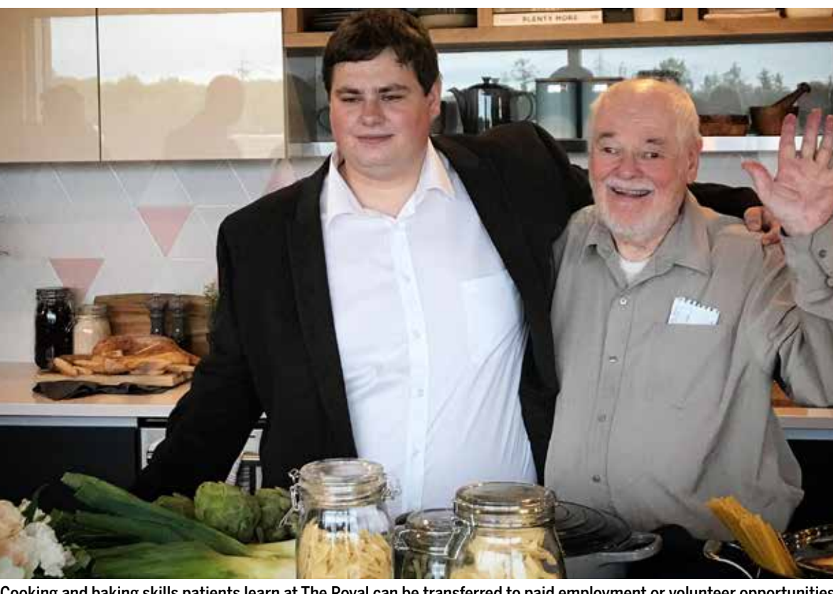
Cooking and baking skills patients learn at The Royal can be transferred to paid employment or volunteer opportunities.