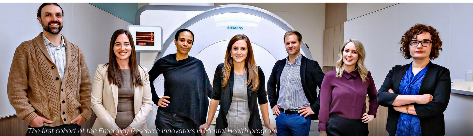
The first cohort of the Emerging Research Innovators in Mental Health program.

The onboarding of all seven researchers as a unified cohort has catalyzed advanced interdisciplinary research as a natural outcome of their bond. With early career scientists representing more than 60 per cent of our roster, we have seen a surge in innovative, bold thinking and decision-making. The Royal is quickly becoming an expert at nurturing early careers and mid-career transitions.