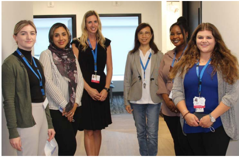
The multi-disciplinary team at The Prompt Care Clinic

Adequate access to mental health care remains the most pervasive challenge we hear about daily. Initially established in May 2020 at the onset of COVID-19, the donor-funded Prompt Care Clinic is designed to provide quick and effective access to care. The Clinic's model allows people to receive a mental health assessment within weeks after referral – a pace unheard of in our current mental health climate.