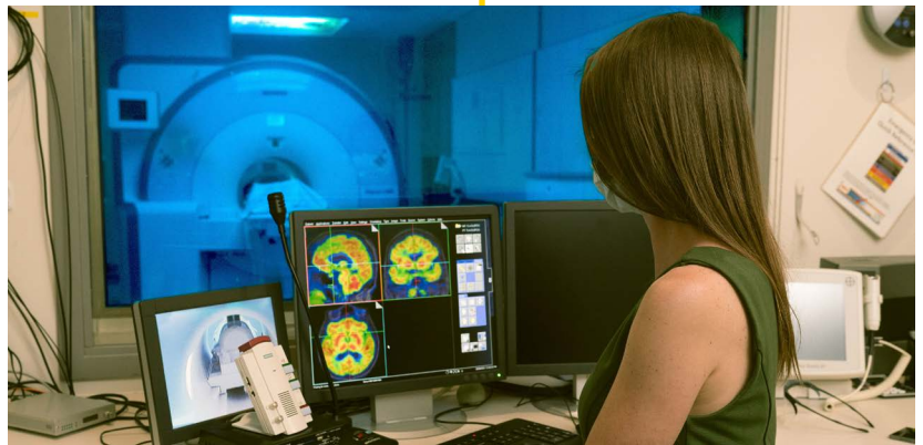
The PET-MRI machine at the Brain Imaging Centre